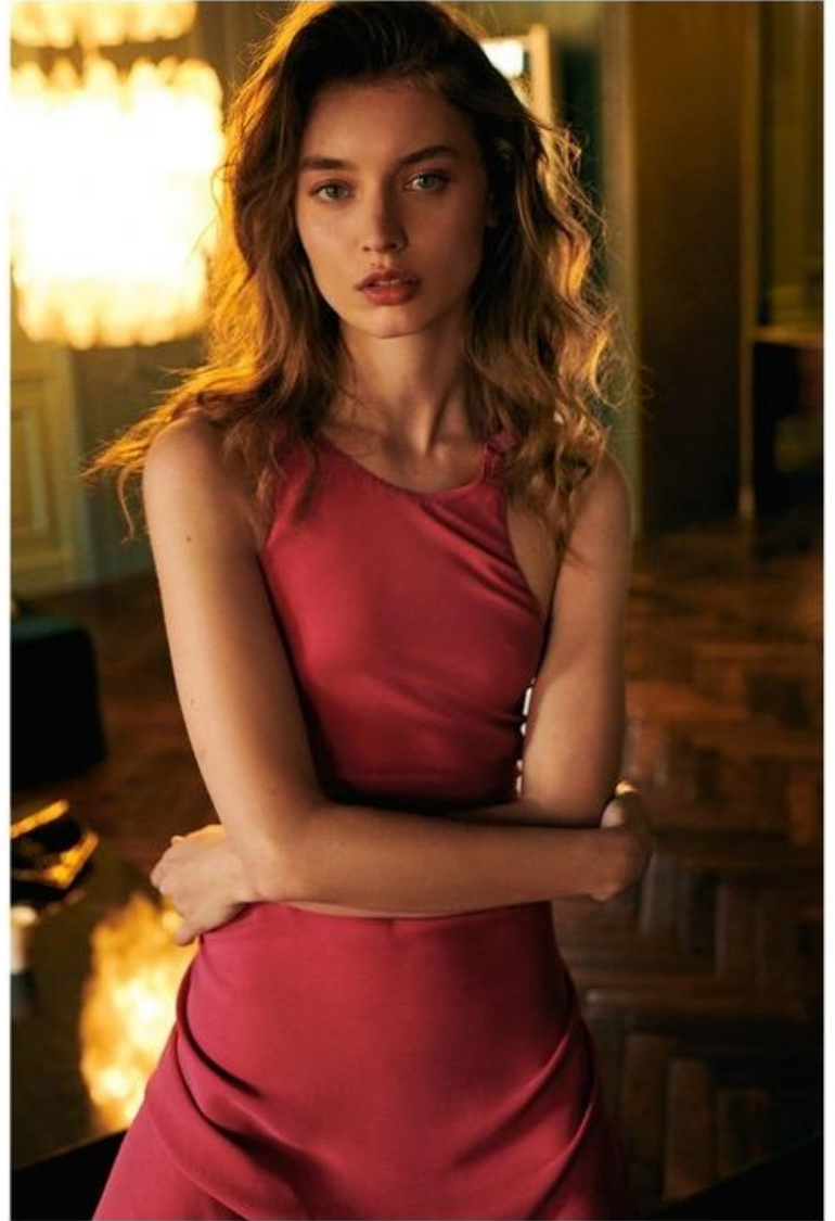
Elbise Fendi YAN SAYFADA: Elbise, sandaletler ve küpeler Fendi