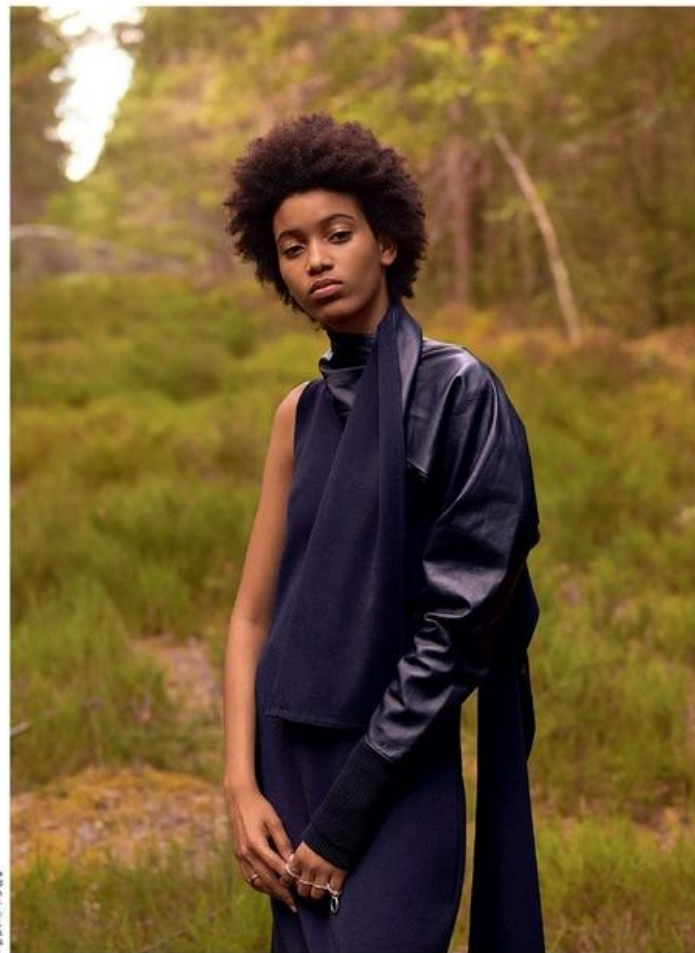
Salvatore Ferragamo dress and sleeves, both price on request, 91603337242. Rings from left: Jessica Billes, $4,000, jessicabilles.com; Spinelli Kilcollin, $1,000.