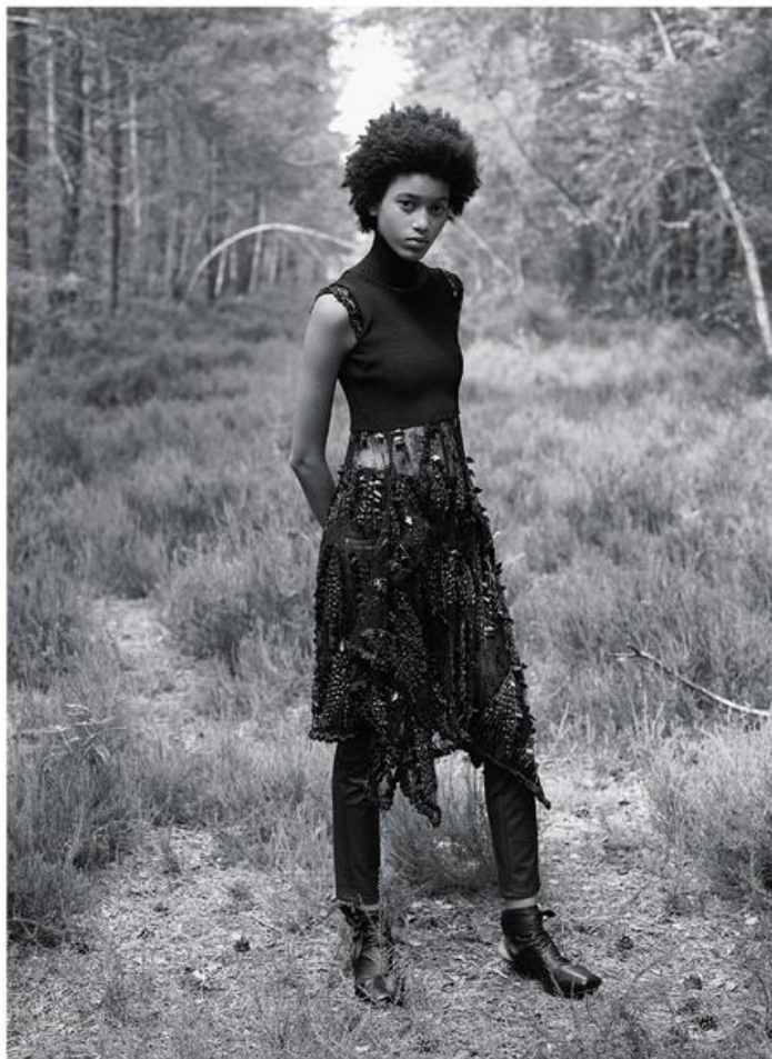
Louis Vuitton top, price on request, dress, $21,200, and pants, price on request, louisvuitton.com. Céline shoes, $580, (212) 535-3703.