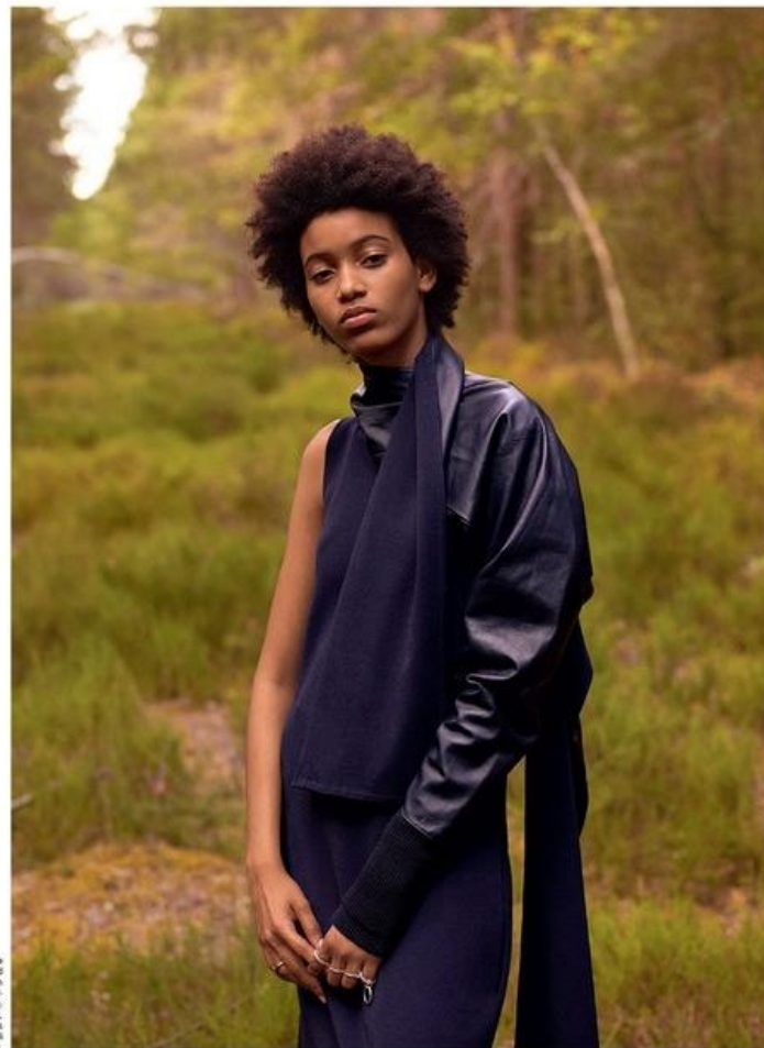
Salvatore Ferragamo dress and sleeves, both price on request, 91603337242. Rings from left: Jessica Baker, $4,000, jessicabaker.com; Spinelli Kilcollin, $1,000.