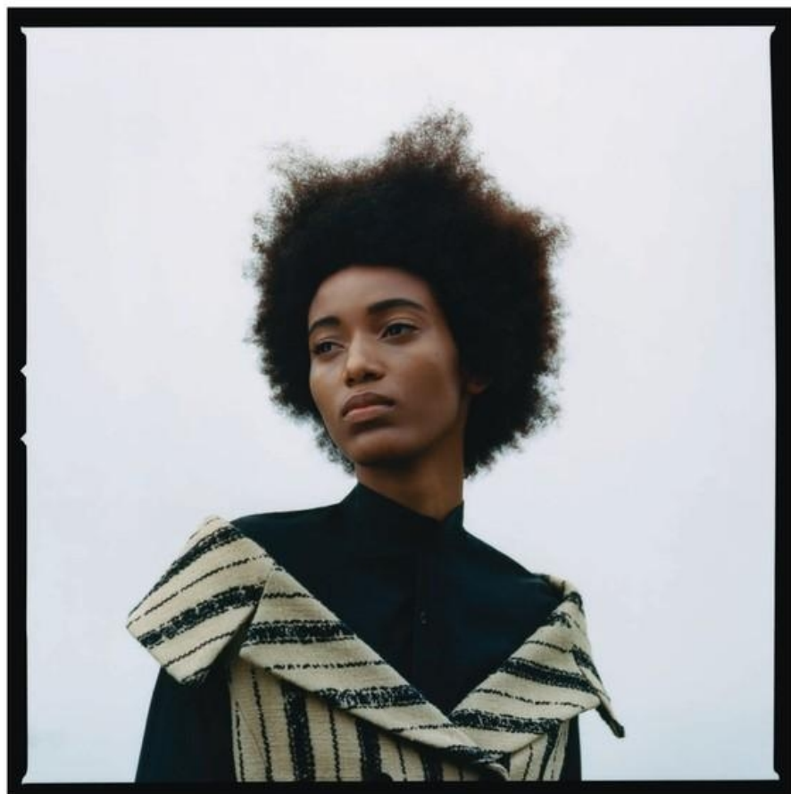
jacket and shirt by DIOR