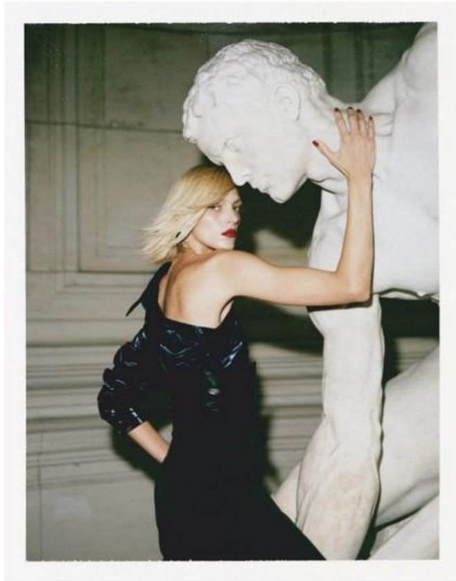
Body asymétrique en coton enduit, et pantalon taille haute en gabardine de laine, MAX MARA. Maquillage Yves Saint Laurent Beauté avec l'Encre de Peau All Hours Foundation BB0, le Full Maître Shadoz: Fiery Coral, le mascara Volume Effet Faux Cils The Carler Noir Innomis, le Rouge Par Couture The Slim Red Ewigowa et, sur les ongles, la Laque Couture Rouge Pop Art. Page de gauche, top volant en tulle plumeux, velours et strass, et pantalon en laine et soie, Dsquared2. Ceinture en cuir, Dundas.