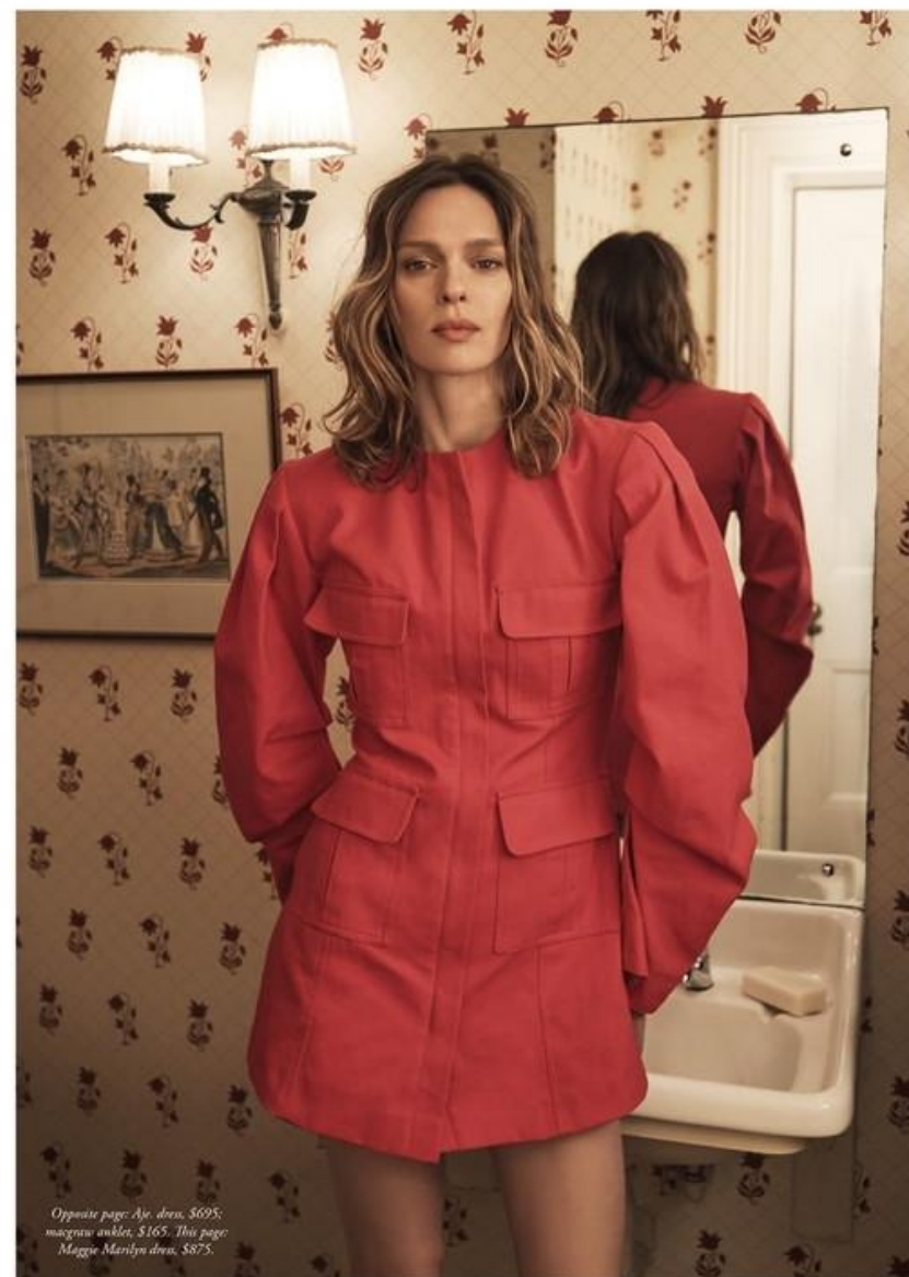
Opposite page: Aje dress, $695; magenta awblet, $165. This page: Maggie Marilyn dress, $875.