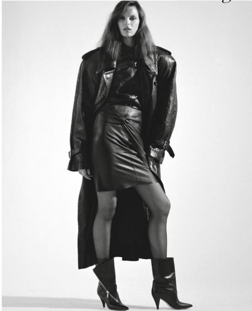
Trench oversized en cuir, Marc Jacobs. Chemise en cuir, Kwaidan Editions, 620 €. Jupon asymétrique en cuir, Ba&sh, 350 €. Bottes en cuir, Givenchy, 995 €.