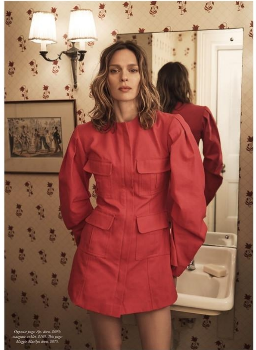
Opposite page: Aje dress, $695; magenta awblet, $165. This page: Maggie Marilyn dress, $875.