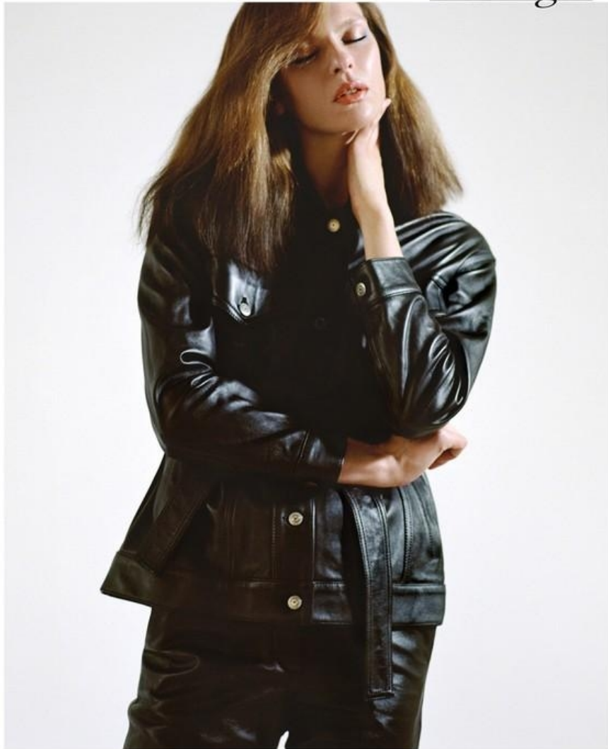
Veste et pantalon en cuir, Golden Goose Deluxe Brand, 1170 € et 1115 €. Maquillage Lancôme avec le fond de teint Miracle Beige Allaire, le Cushion Glow Drops Golden Glow, l'ombree Hypnose Kajal Chroma Cubic Blue par Prouenza Schouler, le crayon Khol Noir, le mascara Monsieur Rig, Big à The New Black, et sur les lèvres, l'Abolu Velvet Matte Beaux Arts.