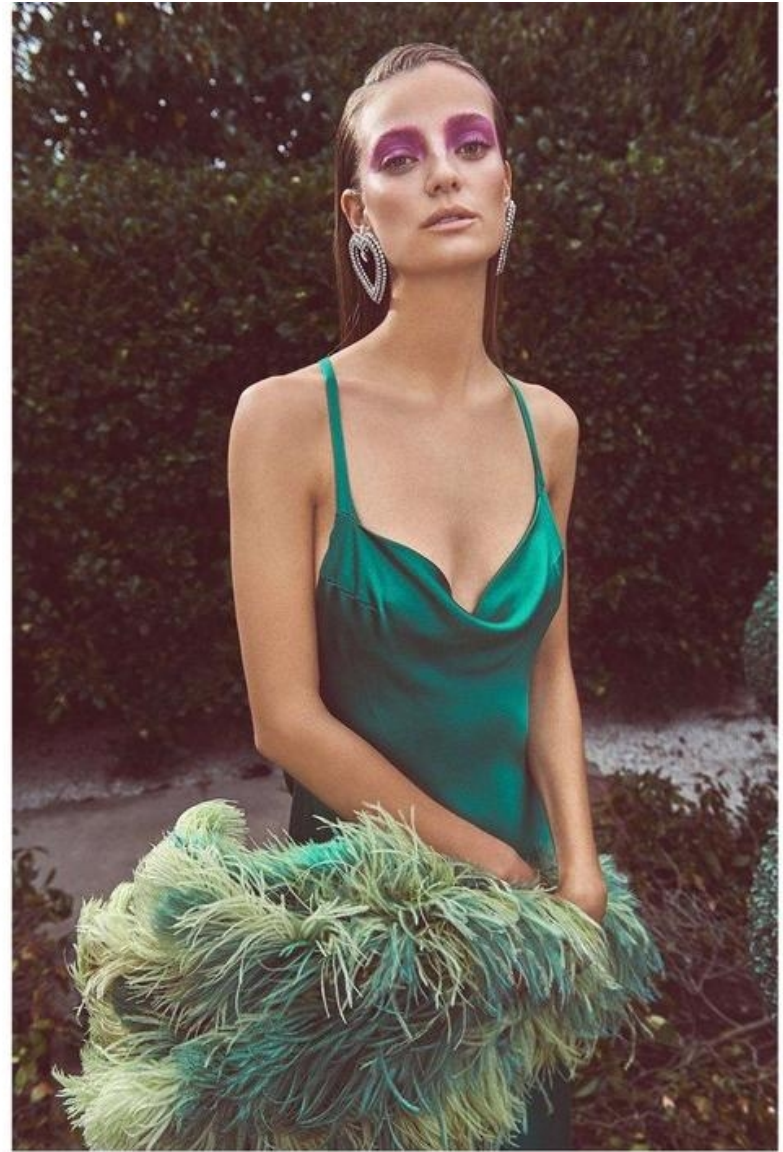
Bodenlanges Kleid aus fließendem Seidensatin mit tiefem Rückenausschnitt, von GALVAN LONDON. XL-Fächer mit Federn, GUCCI. Große Herz-Ohrstecker mit Kristallen, BALENCIAGA