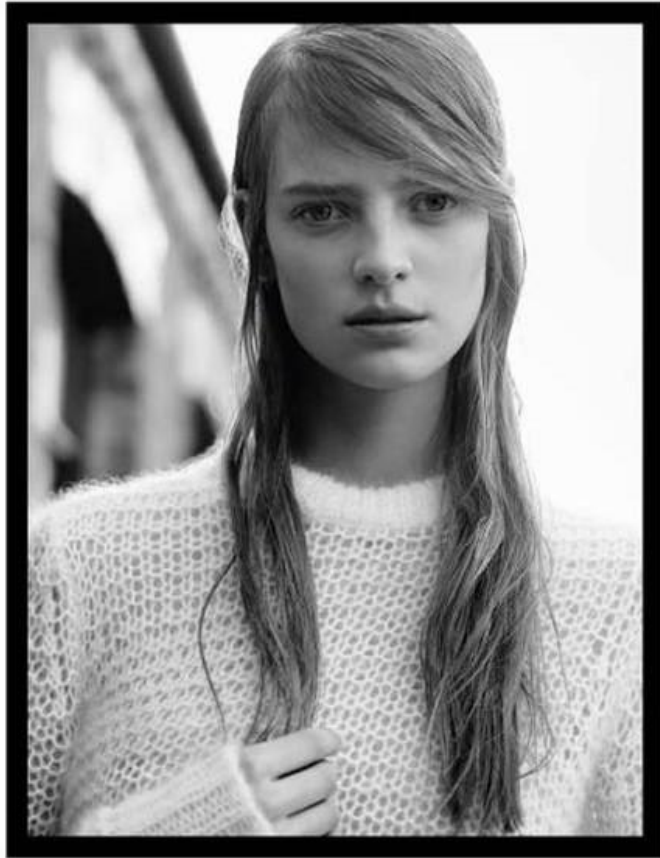
Pull tricoté main en maille mohair, MICHAEL KORS. Page de gauche, pull à plastron boutonné en maille de laine, HOOD BY AIR. Pantalon oversized en toile technique, CALVIN KLEIN COLLECTION. Sandales en cuir, PACO RABANNE. Maquillage Giorgio Armani avec le fond de teint Maestro Makeup Fusion ex. L'Eye & Brow Maestro Jet Black et, sur les lèvres, le Rouge d'Armani Sheer 514.