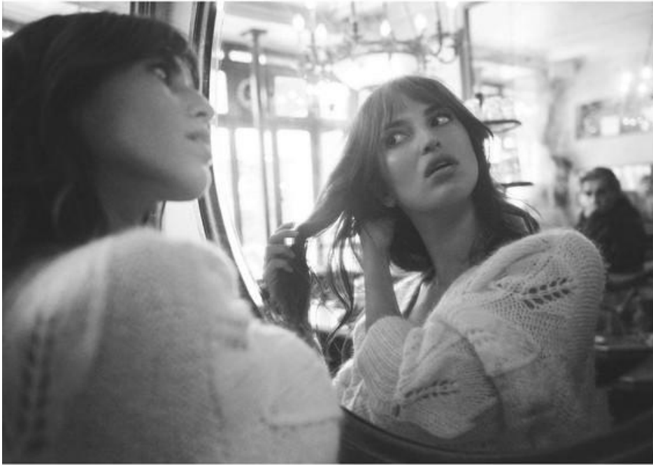
Cream knit top, $320, by Intropia at Christensen Copenhagen. Opposite page: brown jumpsuit, approx $2600, by Stella McCartney.