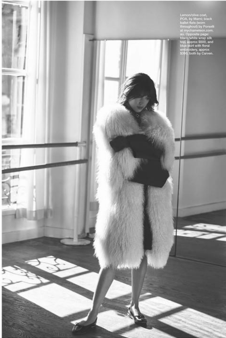
Lemon/olive coat, POA, by Marni; black ballet flats (worn throughout) by Porselli at mycharme.com.au; Opposite page: black/white wrap silk top, approx. $600, and blue skirt with floral embroidery, approx. $340, both by Carven.