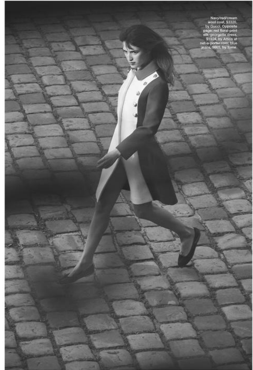
Navy/red/cream wool coat, $3320, by Gucci. Opposite page: red floral-print silk-georgette dress, $1924, by Attico at net-a-porter.com; blue jeans, $65, by Toms.