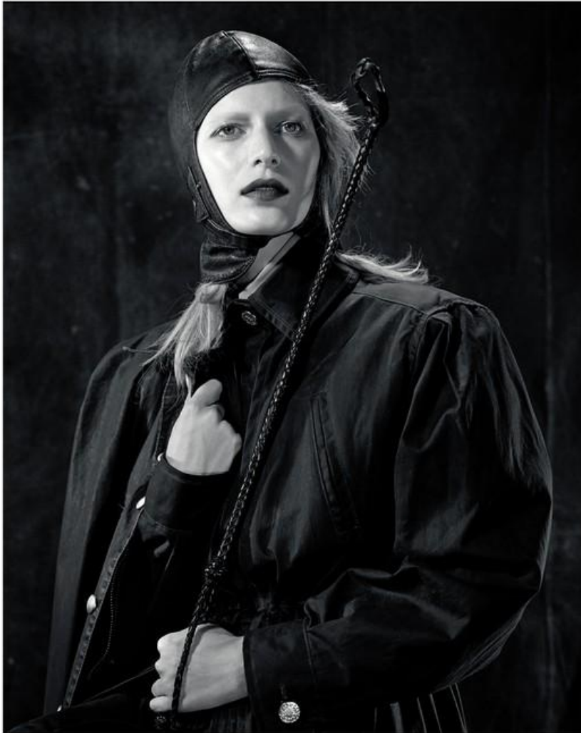
MARRY CHANEL'S MUDDY-BROWN WEATHERPROOFING WITH BLACK LEATHER HEADGEAR FOR A SENSUAL AFFAIR. THIS PAGE: WADED-COTTON COAT $6,040, CHANEL, WADED-COTTON CAPE, WORN ON SHOULDER, $2,120, MIU MIU, COTTON SHIRT, $640, PRADA, VINTAGE FLYING HELMET, FROM A SELECTION, THE VINTAGE SHOWROOM. SUBVERT FASHION'S OUTDOORSY TURN: PROENZA SCHOULER'S RUBBER-HAPPY TRENCH IS PRACTICAL AND PROVOCATIVE. OPPOSITE: TRENCH COAT, FROM A SELECTION, PROENZA SCHOULER, MEN'S COTTON SHIRT, £500, THE ROW, TIE, FROM A SELECTION, PRADA, WADERS, AS BEFORE, VINTAGE HOOD, FROM A SELECTION, THE VINTAGE SHOWROOM. LEATHER GLOVES, £462, RICK OWENS