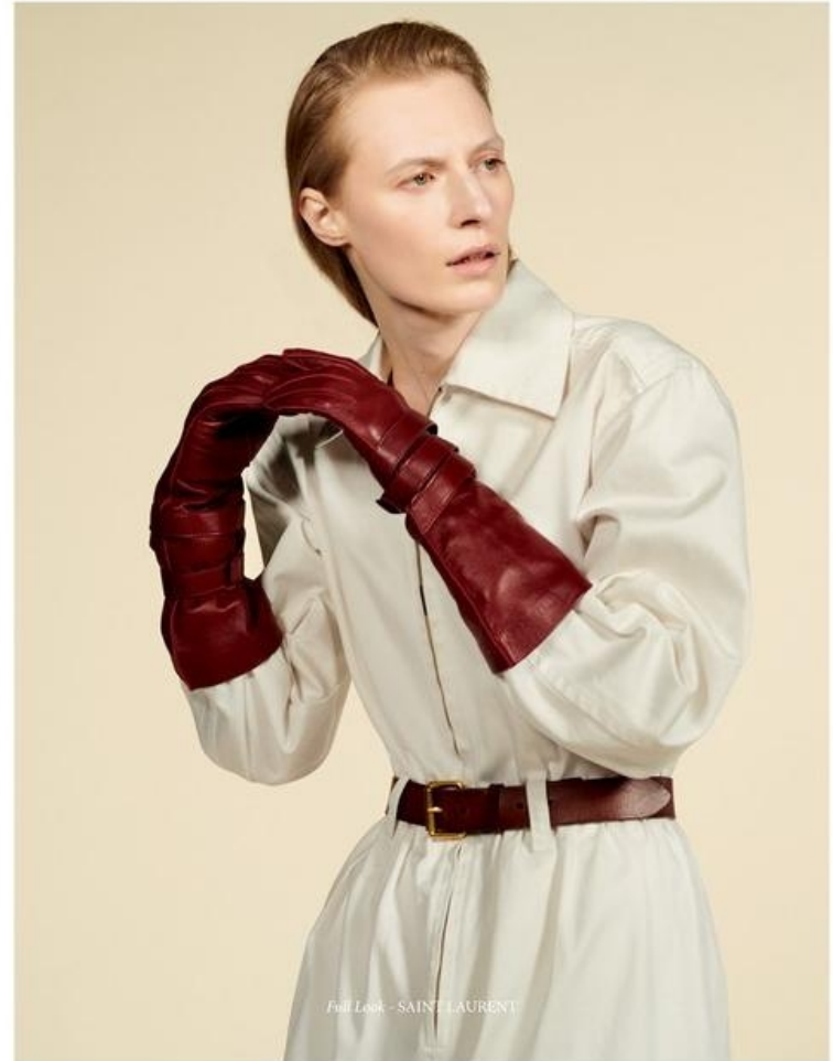
Full Look - SAINT LAURENT