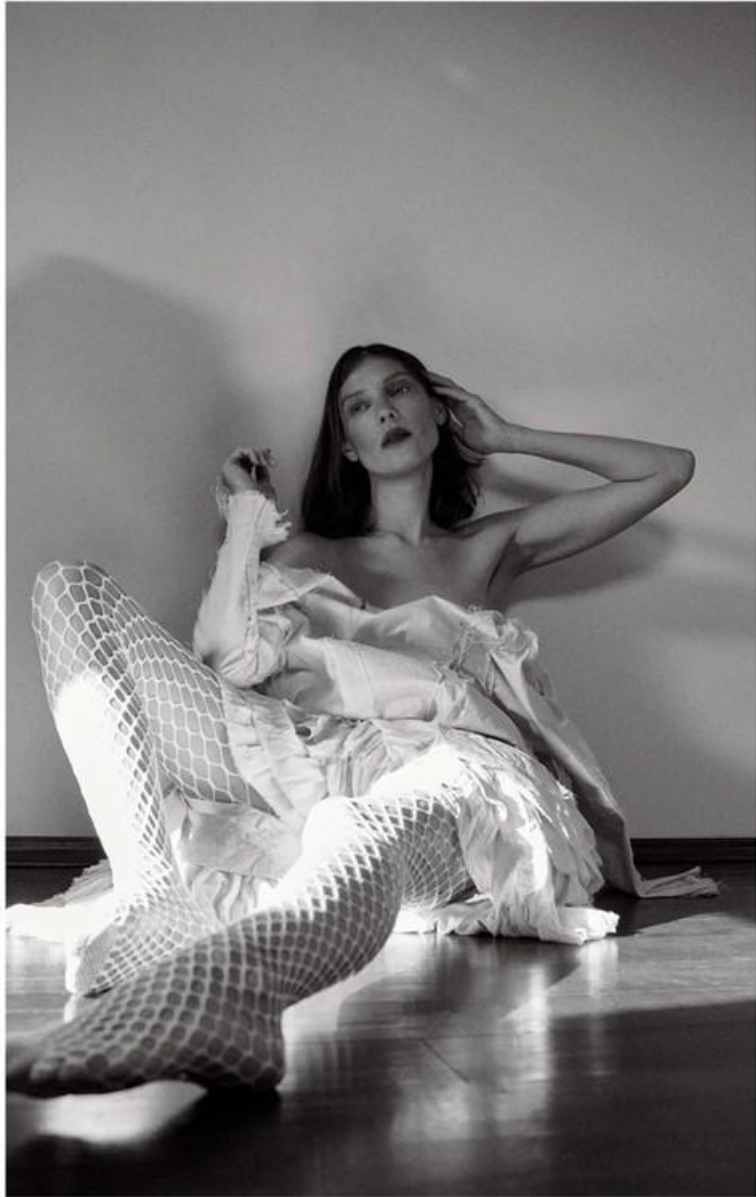
Dress: Thom Browne; Stockings: Tights Warehouse