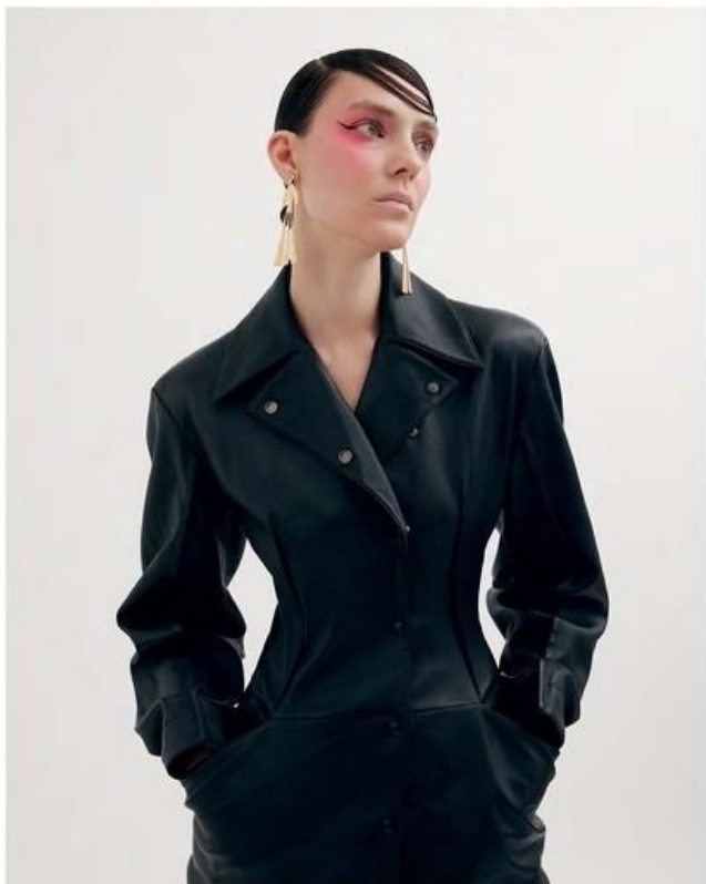
Кожаное пальто, SALVATORE FERRAGAMO ; серьги, кольца, JW ANDERSON . Черная юбка, аксессуары на ногах, BOTTEGA VENETA