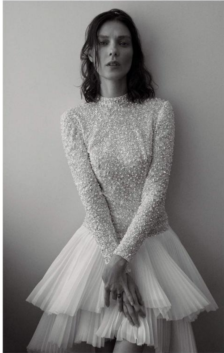
Skirt: Giambattista Valli