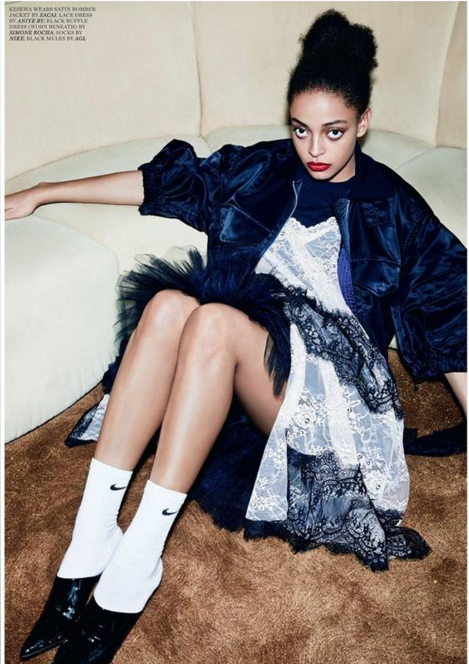
KESEWA WEARS SATIN BOMBER JACKET BY SACAI, LACE DRESS BY ANIYE BY, BLACK RUFFLE DRESS (WOIN BENEATH) BY SIMONE ROCHA; SOCKS BY NIKE, BLACK MULES BY AGL