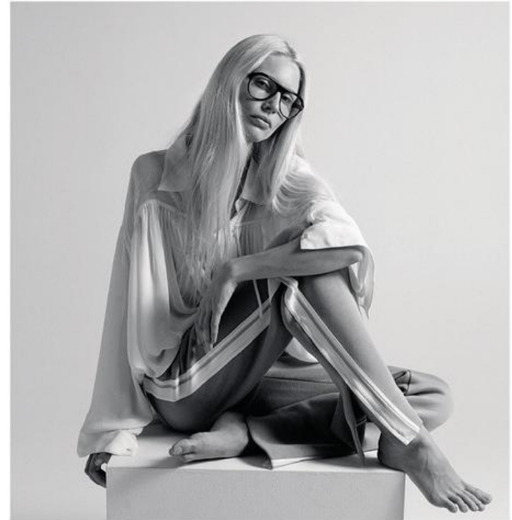
Opposite page: Hand-crocheted floral dress with bell sleeves. This page: Fine crepe blouse and technical jersey tracksuit trousers. Glasses, photographer's own.