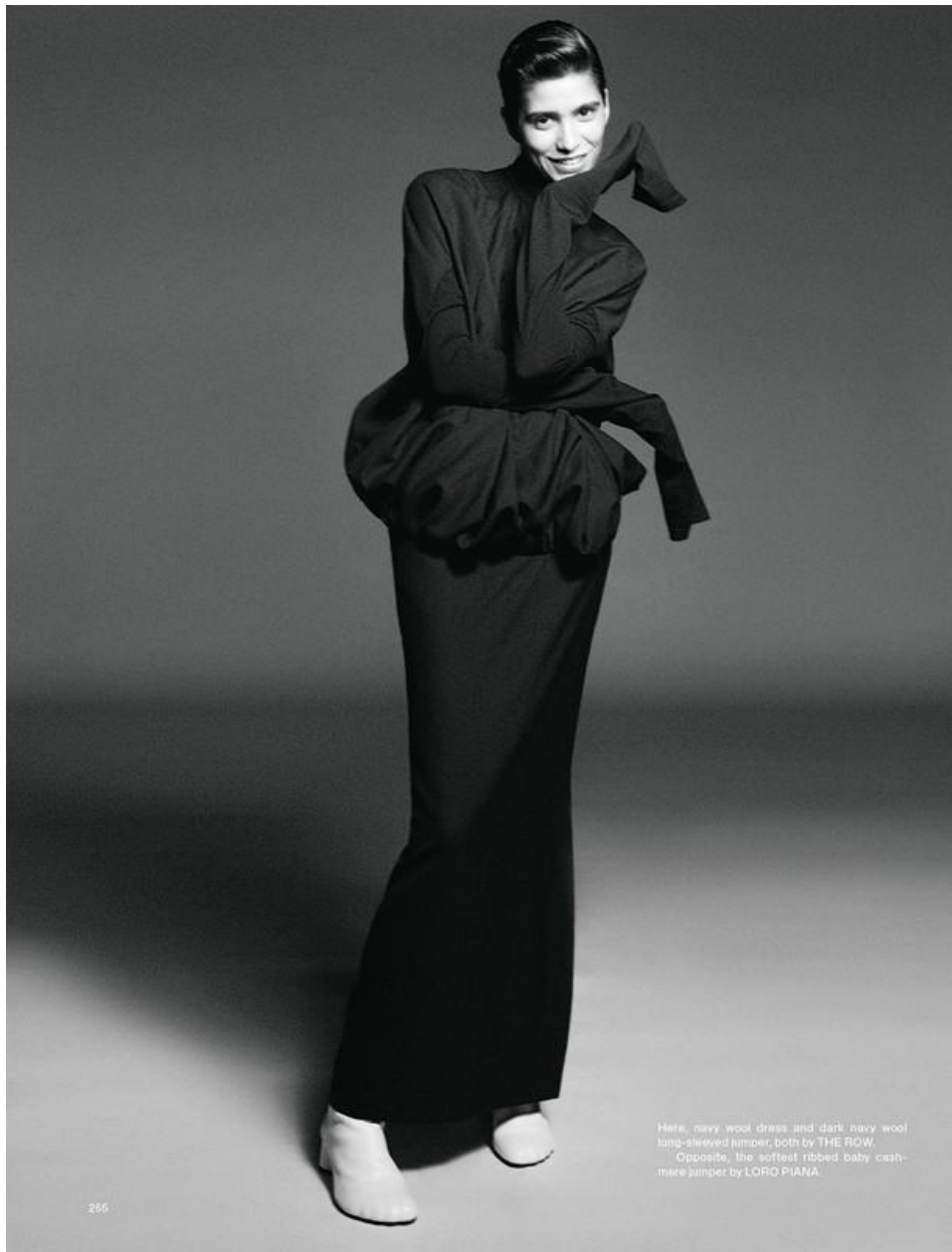
Here, navy wool dress and dark navy wool long-sleeved jumper, both by THE ROW. Opposite, the softest ribbed baby cashmere jumper by LORO PIANA.