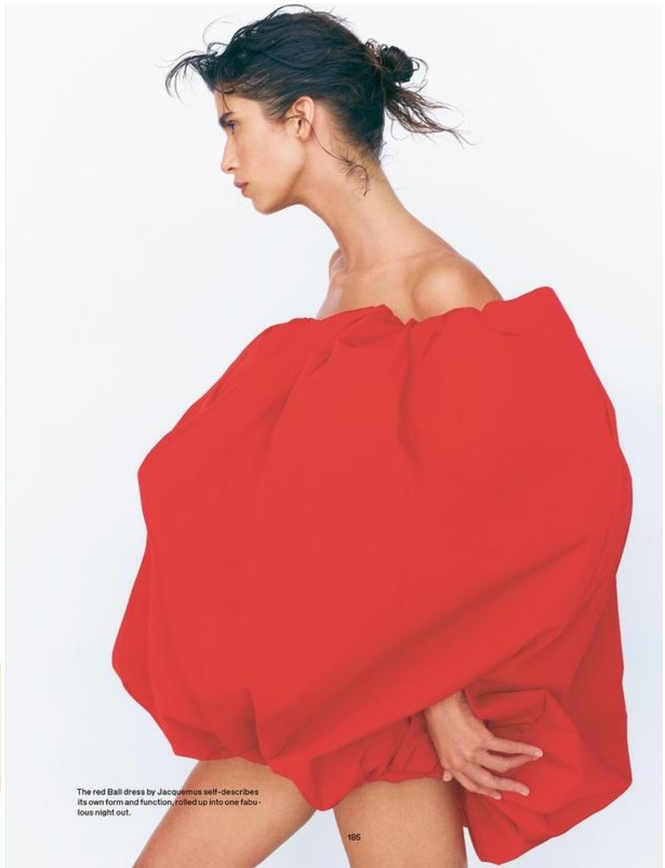
The red Ball dress by Jacquemus self-describes its own form and function, rolled up into one fabulous night out.