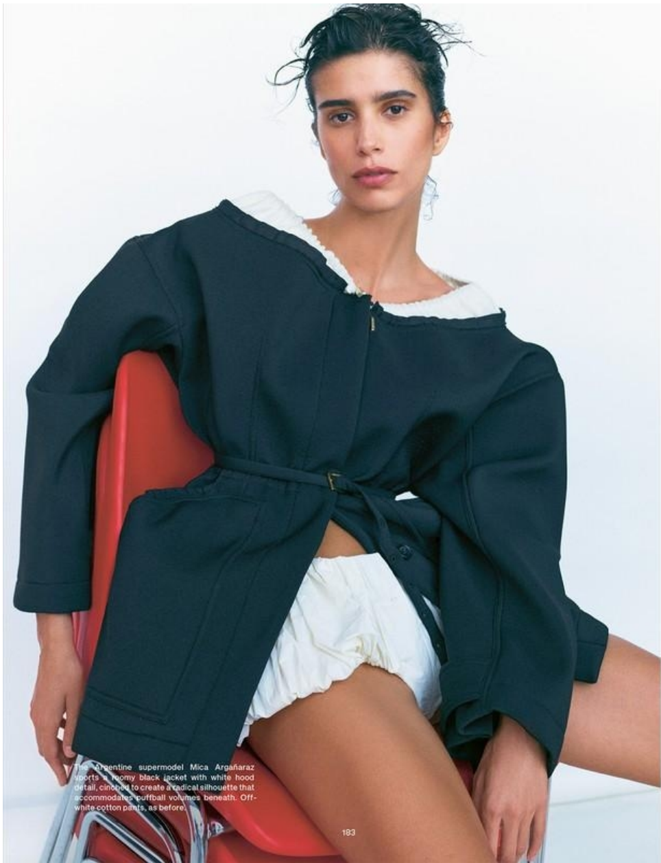
The Argentine supermodel Mica Arganaraz sports a roomy black jacket with white hood detail, cinched to create a radical silhouette that accommodates 'puffball volumes' beneath. Off-white cotton pants, as before.