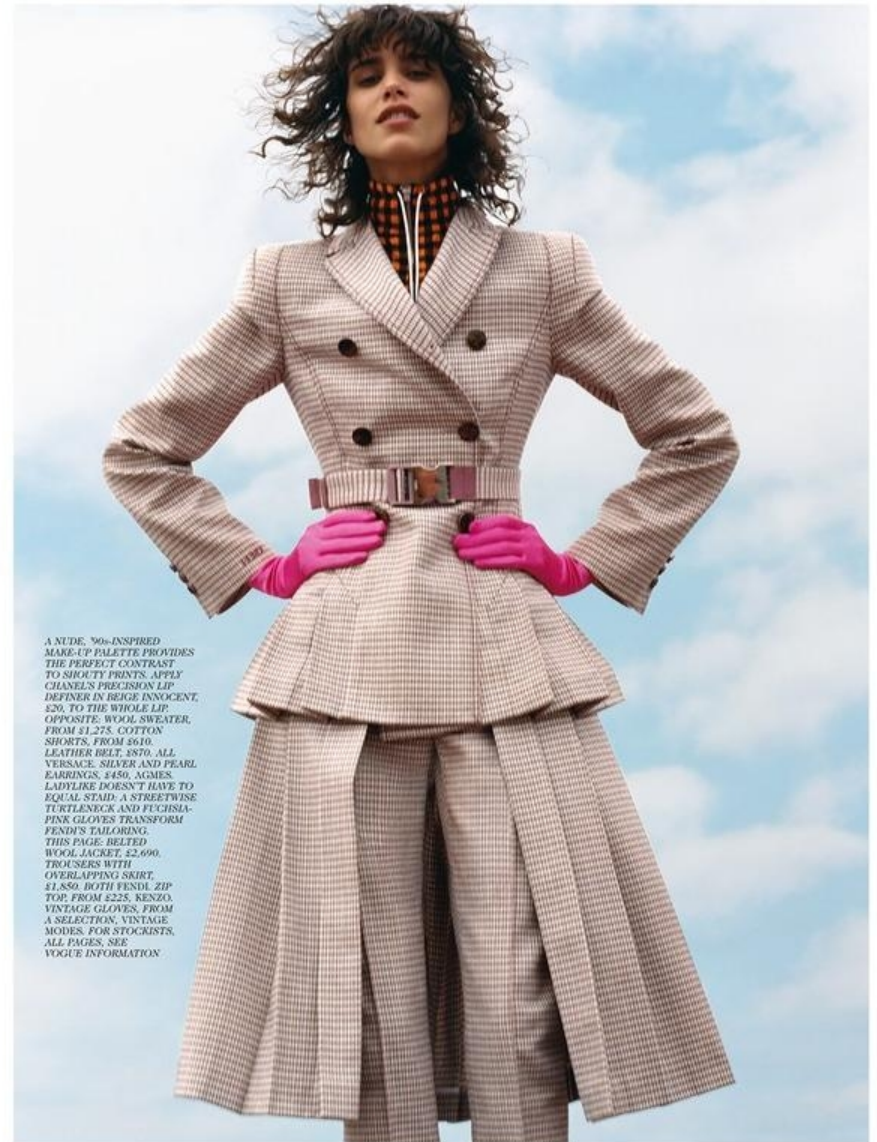
A NUDE, '90s-INSPIRED MAKE-UP PALETTE PROVIDES THE PERFECT CONTRAST TO SMOOTY PRINTS. APPLY CHANEL'S PRECISION LIP DEFINER IN BEIGE INNOCENT, $20, TO THE WHOLE LIP. OPPOSITE: WOOL SWEATER, FROM $1,275. COTTON SHORTS, FROM $610. LEATHER BELT, $870. ALL VERSACE. SILVER AND PEARL EARRINGS, $450. AGNES. LADYLIKE DOESN'T HAVE TO EQUAL STAUD. A STREETWISE TURTLENECK AND FUCHSIA-PINK GLOVES TRANSFORM FENDI'S TAILORING. THIS PAGE: BELTED WOOL JACKET, $2,690. TROUSERS WITH OVERLAPPING SKIRT, $1,550. BOTH FENDI. ZIP TOP, FROM $225. KENZO. VINTAGE GLOVES, FROM A SELECTION. VINTAGE MODES. FOR STOCKISTS, ALL PAGES. SEE VOGUE INFORMATION.