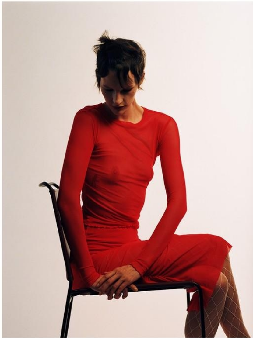
TOP AND SKIRT PRISCAVERA FISHNET LEGGINGS STYLIST'S OWN OPPOSITE PAGE — DRESS CELINE BY PHOEBE PHILO/ALBRIGHT FASHION LIBRARY