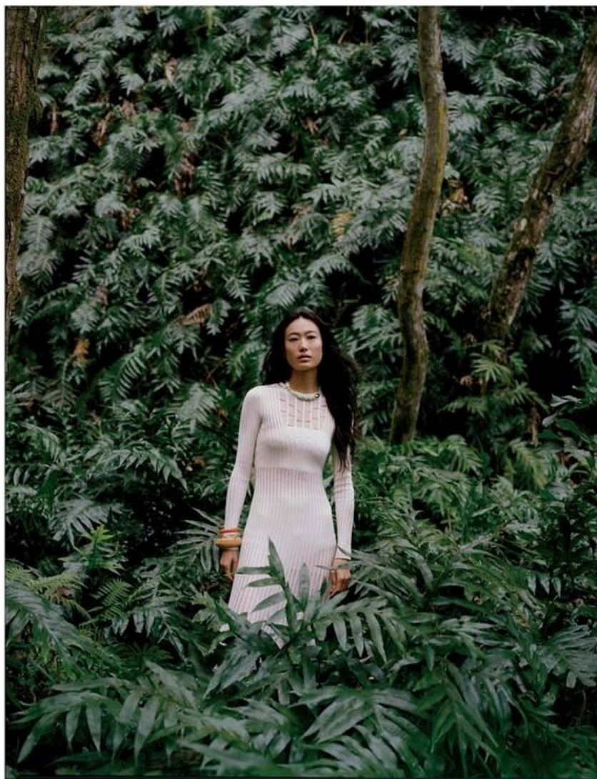
左页·时装 La Collection: 针织短裙 Osmos; 耳环、手镯 均为Lizzie Fortunato; 金色手镯 Ferragamo; 印花头巾 Vintage 本页: 针织连衣裙 Gabriela Hearst; 抹胸、打底短裤 均为Vintage; 项链、手镯 均为Lizzie Fortunato