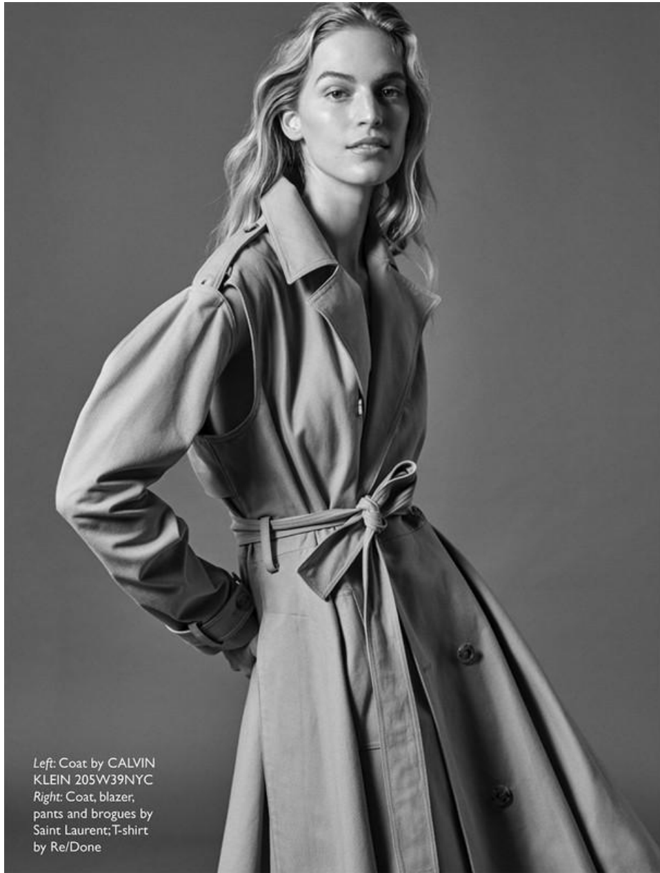
Left: Coat by CALVIN KLEIN 205W39NYC Right: Coat, blazer, pants and brogues by Saint Laurent; T-shirt by Re/Done