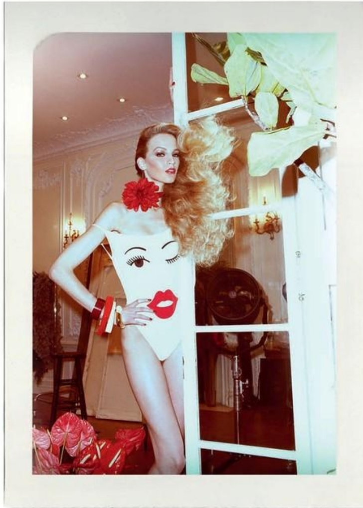
Qui sopra. Costume monopezzo con applicazioni, Moschino Swim. Bangles Ben Amur, Lynn Bari e Kara Ross. Nella pagina accanto. Tunica di georgette di seta, Gucci; costume Thopelo. Bracciali Jorge Coicedo Montes de Oca; Lynn Bari, Kate Spade e Ben Amur; cintura vintage, Yves Saint Laurent da Lynn Bari. Per lui: hot e pins, Star Struck.