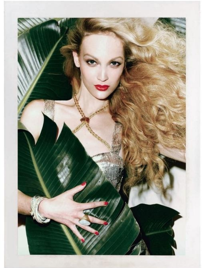
Qui sopra. Abito bustier a stampa floreale con paillettes, Burberry Prorsum. Collana Lynn Bari; clip Camilla Dietz Bergeron; bangles Chanel e Lynn Bari; anello Lynn Bari. Nella pagina accanto. Costume a spalline sottili con motivo a nodi, Chanel.