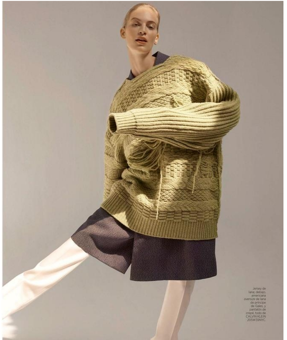
Jersey de lana, debajo americana oversize de lana de príncipe de Gales, y pantalón de crepé, todo de CALVIN KLEIN 205W59NYC.