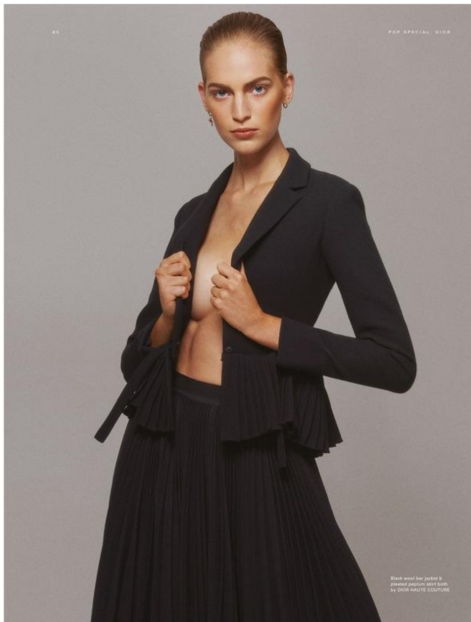
Black wool bar jacket & pleated peplum skirt both by DIOR HAUTE COUTURE