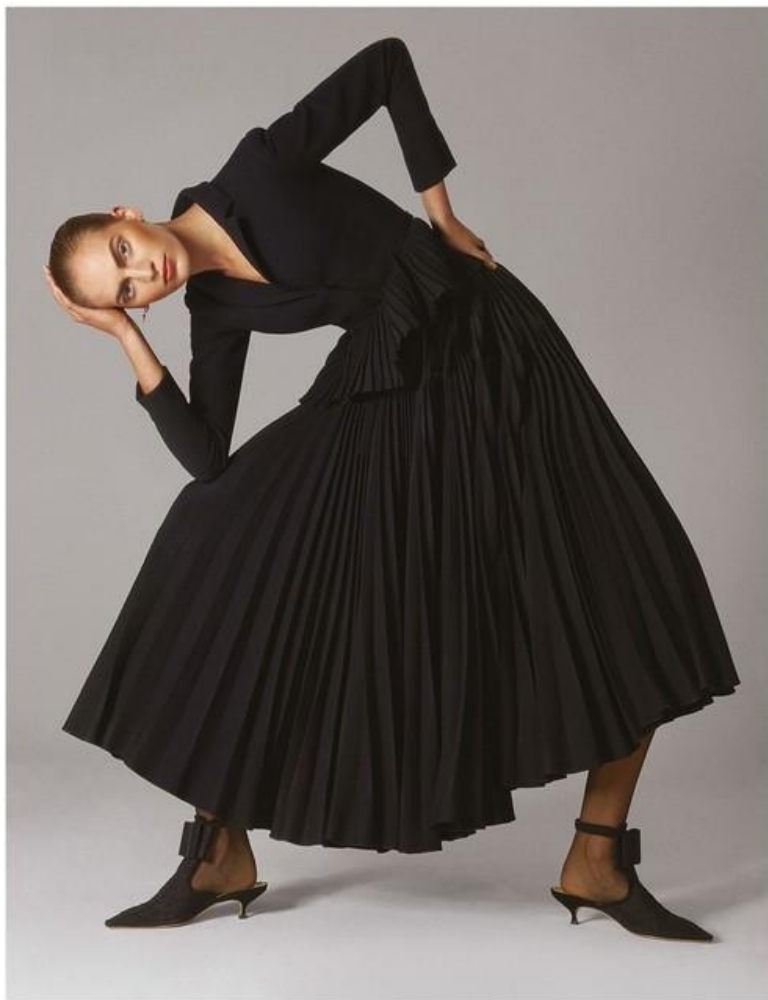
Black wool bar jacket, pleated peplum skirt & black feathered tulle mules with a black velvet bow all by DIOR HAUTE COUTURE