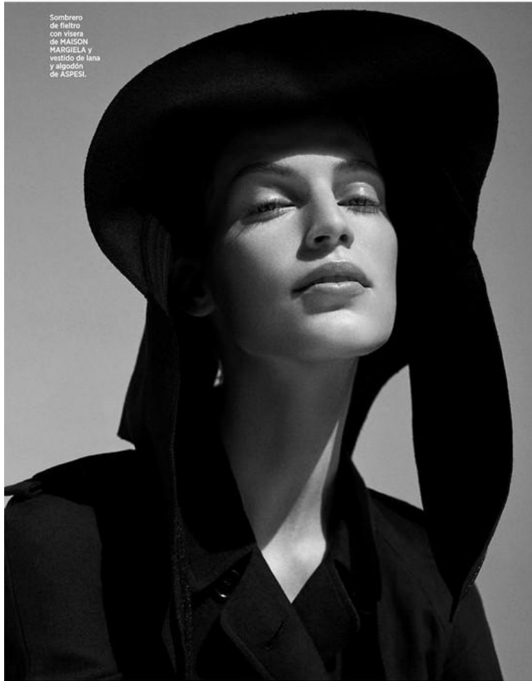
Sombrero de fieltro con visera de MAISON MARGIELA y vestido de lana y algodón de ASPEL.