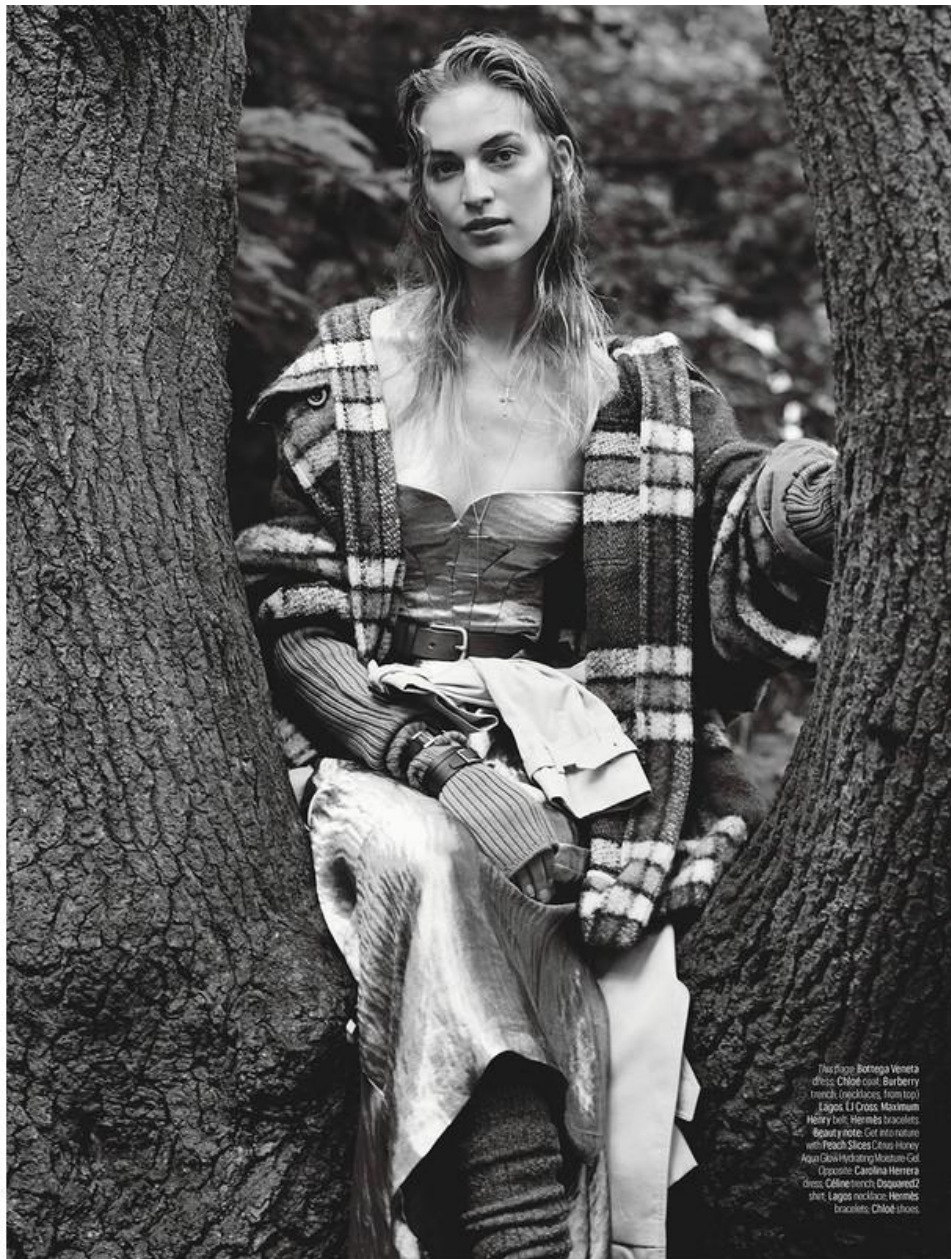
The piece: Bottega Veneta dress; Chloé coat; Barberry trench; (neckties, from top) Espino Li Orso; Massimo Osti; both Hermès bracelets; Boudry note; Got into nature with Peach Slices Citrus Honey Aqua Glow Hydrating Moisturizer Gel; Opposite: Carolina Herrera dress; Caline Herich; Dossard2 shirt; Lagos necklace; Hermès bracelets; Chloé shoes.