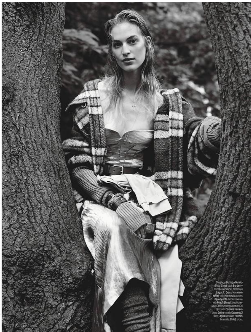
The piece: Bottega Veneta dress; Chloé coat; Barberry trench; (neckties, from top) Espino Li Orso; Massimo Osti; both Hermès bracelets; Boudry note; Got into nature with Peach Slices Citrus Honey Aqua Glow Hydrating Moisturizer Gel; Opposite: Carolina Herrera dress; Caline Herich; Dossard2 shirt; Lagos necklace; Hermès bracelets; Chloé shoes.