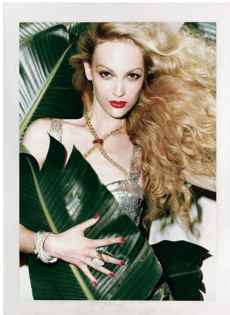
Qui sopra. Abito bustier a stampa floreale con paillettes, Burberry Prorsum. Collana Lynn Bari; clip Camilla Dietz Bergeron; bangles Chanel e Lynn Bari; anello Lynn Bari. Nella pagina accanto. Costume a spalline sottili con motivo a nodi, Chanel.